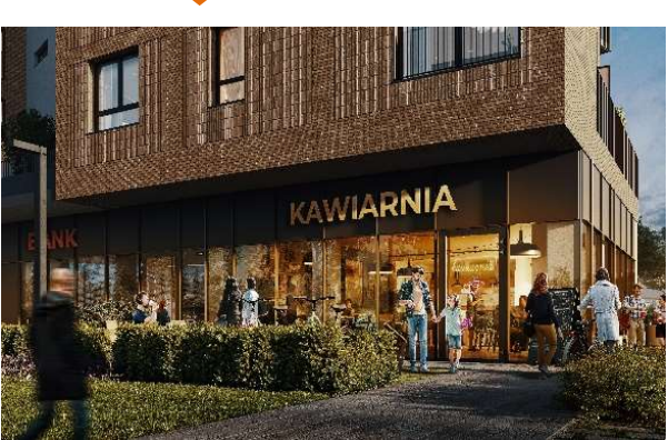
*Concept visualisation of the development

After all the milestones above have been achieved, there will be an opportunity to significantly increase the value of each of the plots in the current portfolio for the best possible price. The scope of the additional work of the CeMat team for each of the plots and projects will be analysed on an individual basis, taking into account the potential risks, time frames, human resources and possibilities of obtaining additional benefits versus the current land value. Based on these factors, we will make a final decision about the benefits of carrying out development projects.