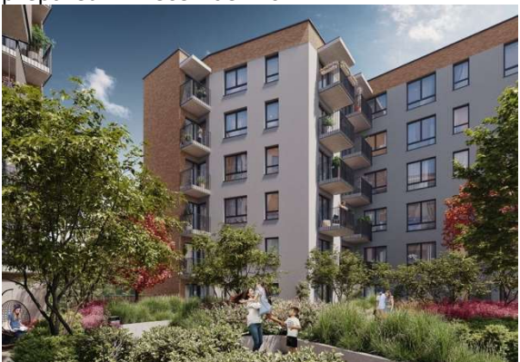
*Concept visualisation of the development

A comprehensive valuation report covering all the plots located in Bielany, Warsaw, will be prepared in December 2022.